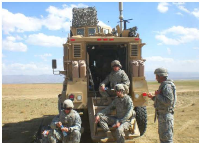
Top Right: 1st PLT Soldiers taking a rest after stretching HESCOs