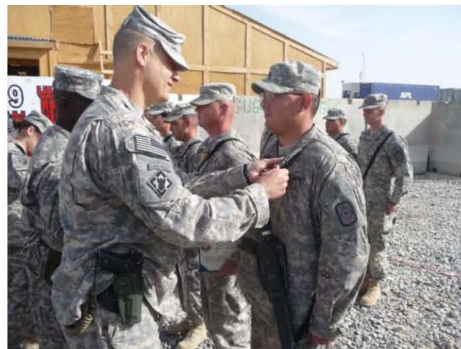
BC pins EOT award on Soldier from 655th