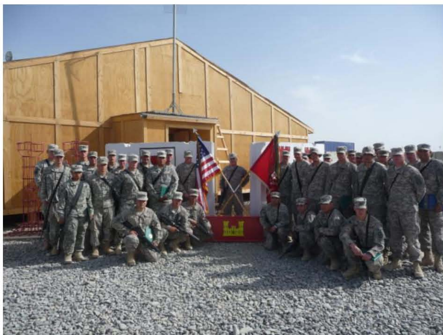
655th pauses for photo following their end of tour awards presentation ceremony