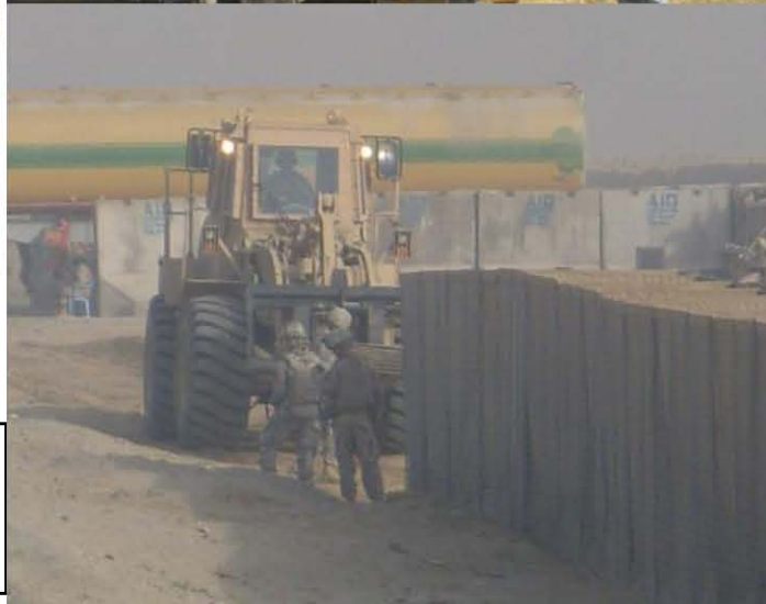
Bottom Right: Soldiers stretching HESCOs with heavy equipment.